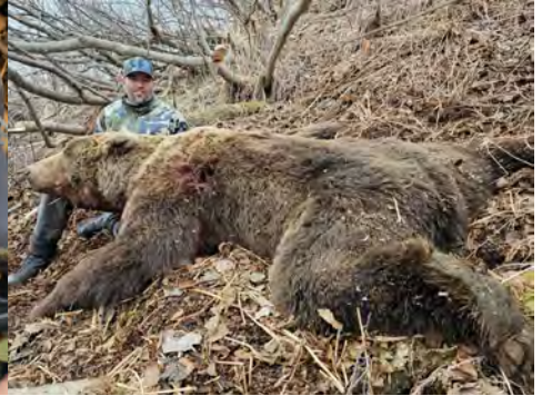
Brock Beran - Wichita, KS